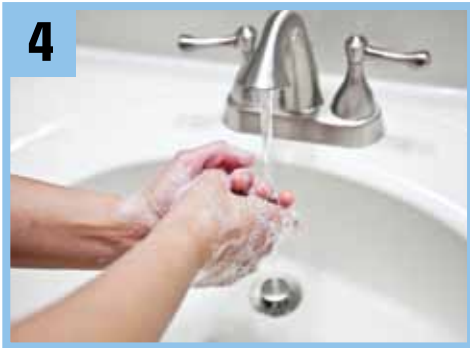
4 Wash hands for 20 seconds.