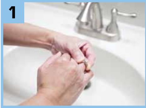
1 Remove any jewelry.