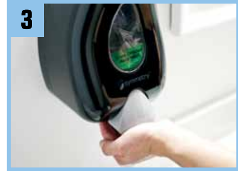
3 Dispense soap.