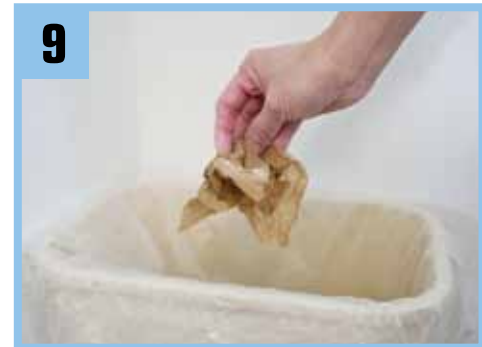
9 Throw towel in garbage.