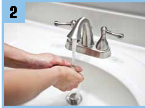
2 Wet hands and wrists.