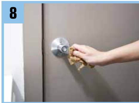
8 Open door with towel.